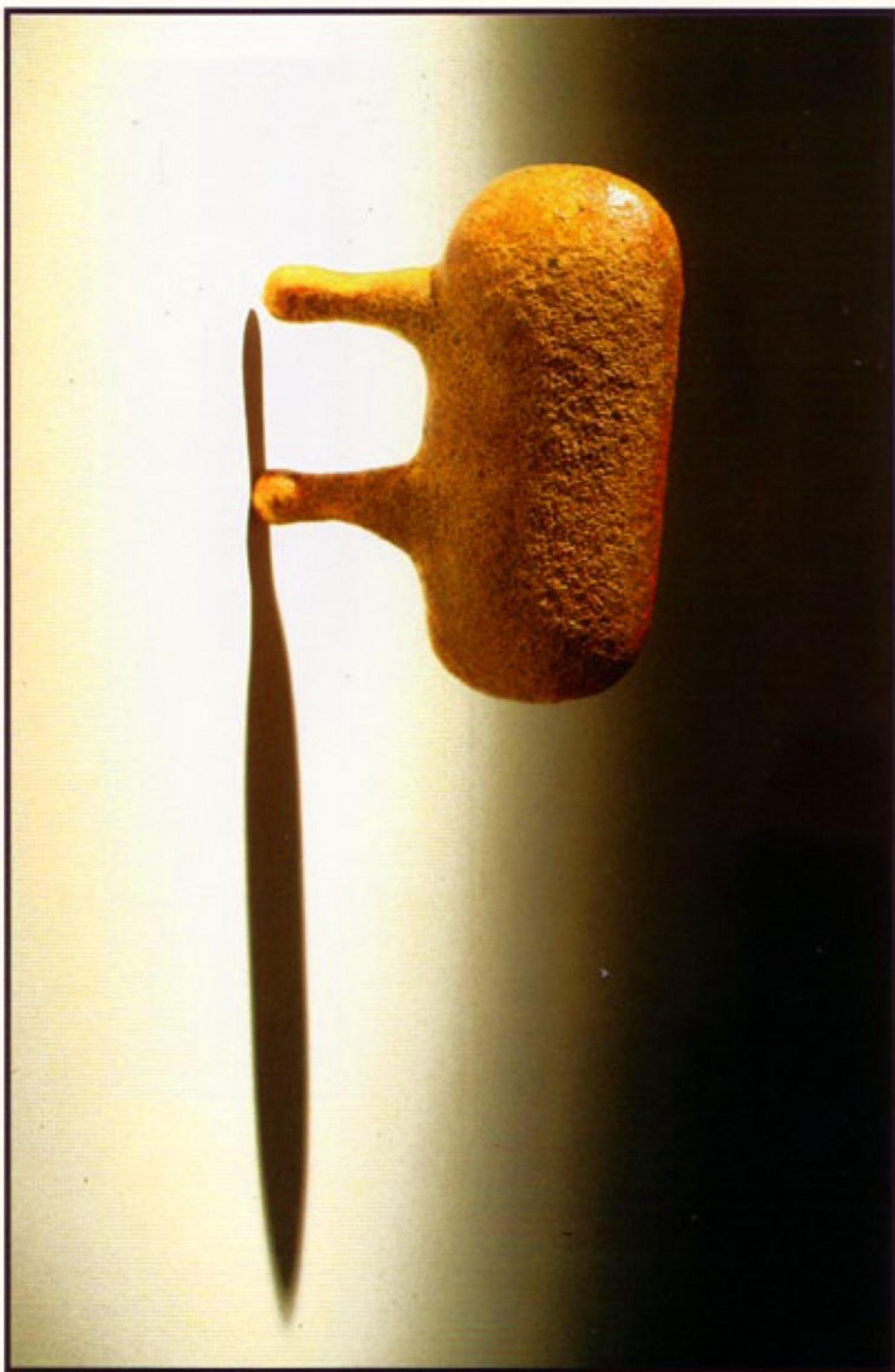
Comb (ocular) , Ceramic, epoxy, paint, 7.25" x 2.25" x 5.25", 1999

Obviously, it is not realized exclusively through working. One comes to the process with what one is—with a certain capacity for experience. Being curious about the world through creative work involves, essentially, an investigation into the nature of the Self, into consciousness and the structure of what one is made of: energy, pattern, intelligence, and the connection with origin. Curiosity is a gift which is fulfilled through the ability to listen. Listening to the quietest messages focuses the attention at the moment a "thing" is manifested. For this timing is necessary. Timing is rhythm, and without rhythm we are lost. Utilizing time is dancing with time and not being eaten up by it. There is sheer joy in it. Resonating with this pulse of the Self is equal in degree to the charge of the object. This is ultimately based in awareness. What is brought to the making process is transformed into the emergence of a new reality. The greater the awareness, the more profound the reality—exposing something closer to the truth. Owning more of that truth through the process of creating is reason enough to continue.